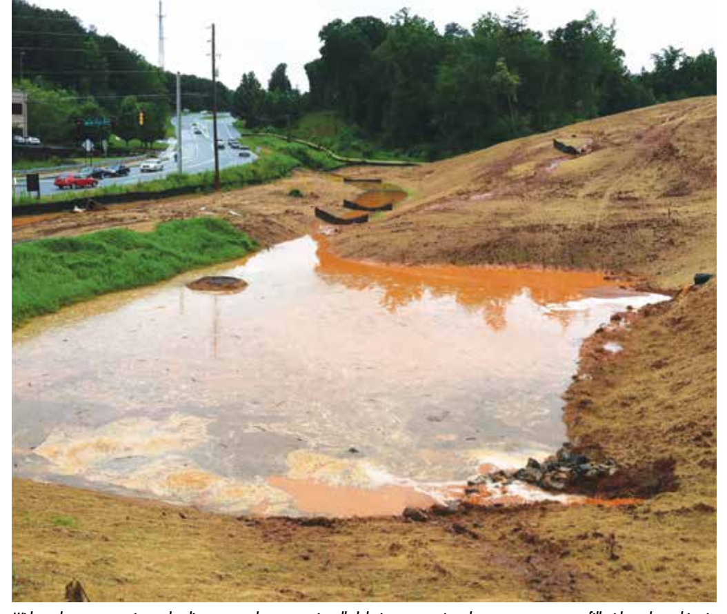
Without the proper erosion and sediment control measures installed during construction, downstream waterways fill with mud, resulting in environmental and economic damage.

In 2003, the General Assembly enacted major changes in Georgia's erosion and sedimentation control law by passing House Bill 285; CRK was actively involved in the passage of this legislation and the studies that preceded it. HB 285 resulted in a number of historic changes in the law, including a new permit fee to provide revenue to support the