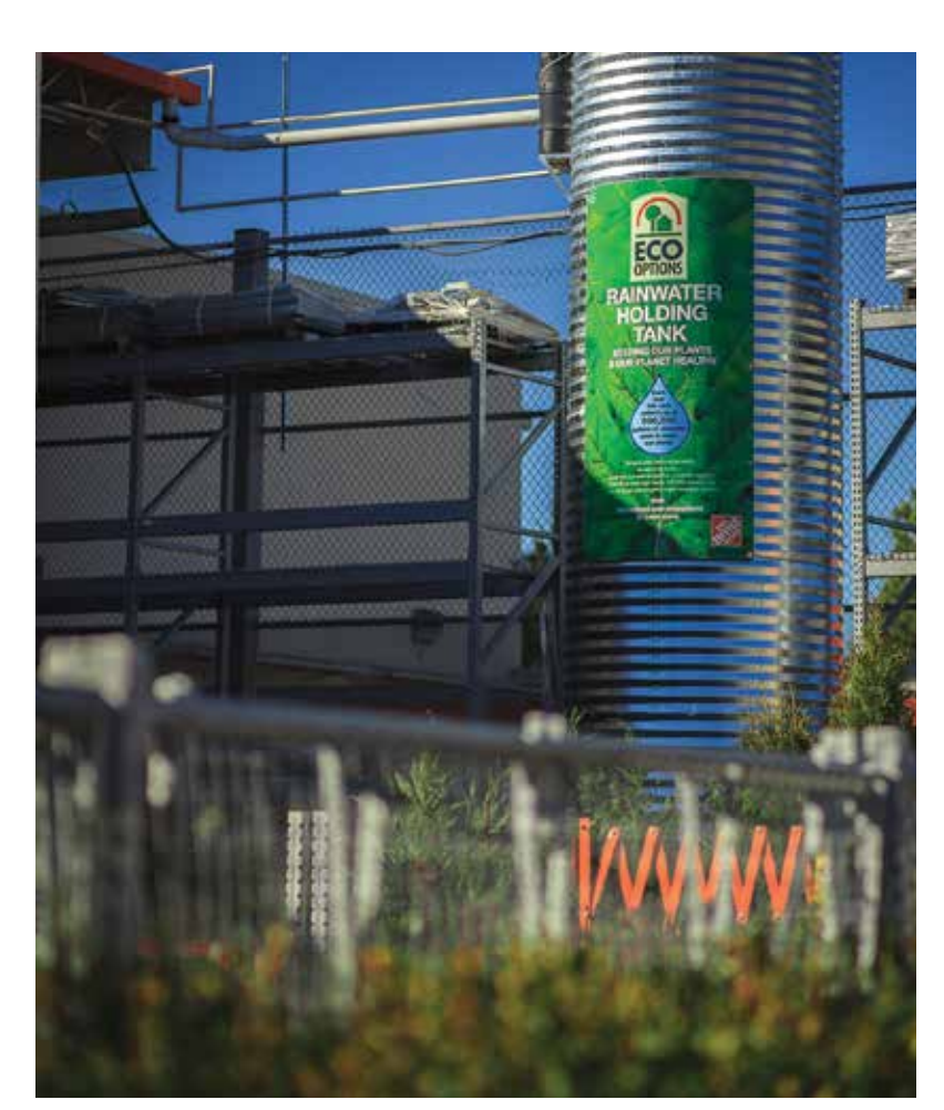
Each rainwater tank helps The Home Depot save 500,000 gallons per year.

For tips on how you can save water, visit our "No Time to Waste" webpage (http://www.chattahoochee.org/no-time-to-waste.php).