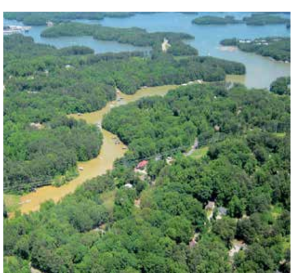
A breach at the Lake Alice dam dumped tons of sediment into Lake Lanier.

Of the nearly 4,300 dams inventoried in Georgia, the state requires the owners to maintain only 484 of them, based on current law. Common problems include trees growing on the face of the dam, rotting and rusted spillways and pipes, severe erosion, and seepage. These problems are exacerbated when upstream areas are hardened with roadways, parking lots and rooftops - and stormwater is propelled toward the dams like a ball out of a cannon. Georgia must invest necessary resources to adequately inspect all dams in the state and then follow up to ensure that any problems are corrected.