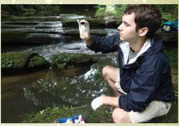
CRK staffers investigated Tanyard Creek, where a spill led to nearly 10,000 gallons of raw sewage flowing into the creek, killing more than 100 fish.