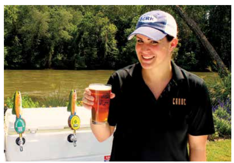
About 200 guests joined us at Canoe for the End of Summer BBQ.

The campaign supports CRK's river patrol and water monitor-