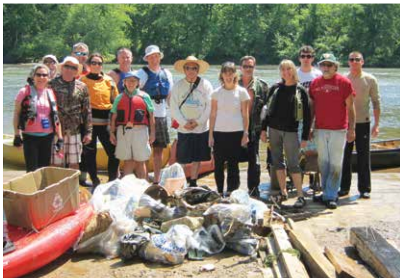
Last year's Sweep the Hooch cleanup netted 3.81 tons of trash.

We won't just be out on the water during Earth Month. For the second consecutive year, Aveda — a beauty company with a strong environ-