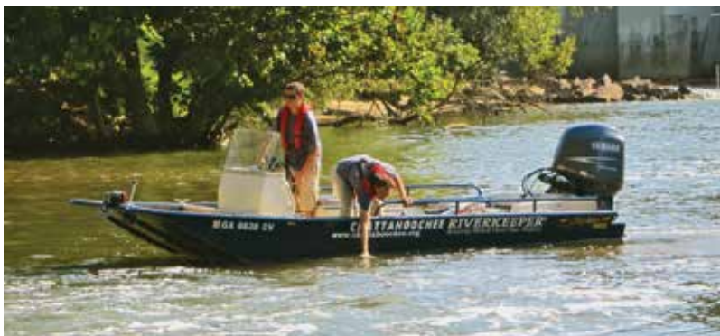
CRK staff investigated 49 sites and secured 10 enforcement actions to stop pollution.

Chattahoochee Riverkeeper enjoyed a tremendous year of accomplishments in protecting and restoring the river that supplies drinking water, recreation and more for nearly 4 million Georgians. Here's a look at our 2012 metrics — check out the complete list at www.chattahoochee.org/accomplishments/php .