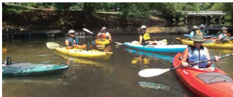
Nine paddles trips were organized for canoeists and kayakers, including the River Discovery Series.