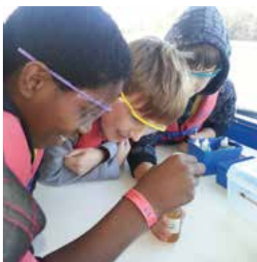
We brought 4,427 students and educators aboard our floating classroom, 955 who received scholarships.

20 Neighborhood Water Watch programs monitoring 39 stations.