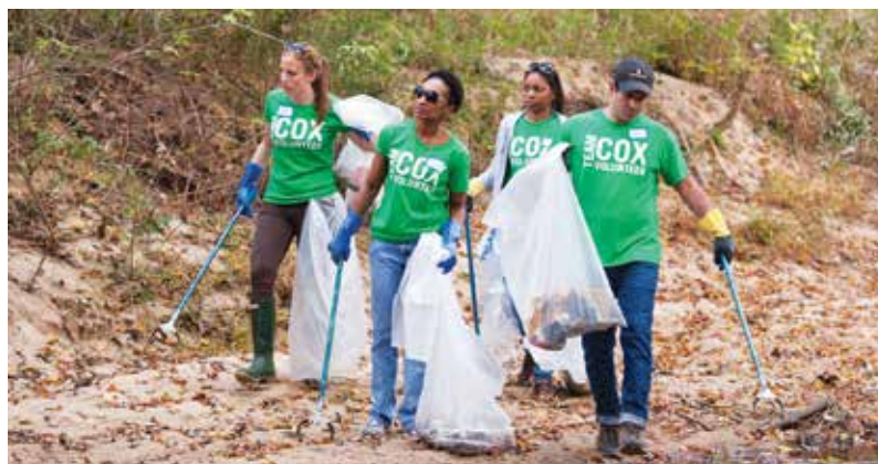
Cleanups drew 1,136 volunteers picking up trash at stream, lake and river cleanups.

If you prefer to receive RiverCHAT electronically, contact David Lee Simmons at dsimmons@chattahoochee.org .