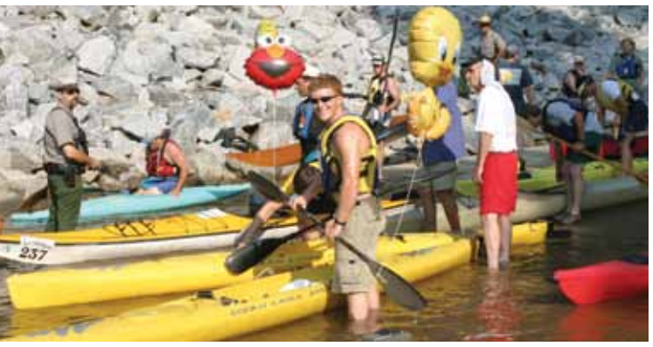
Advanced registration for the face and festival runs through June 7.

P addlers of all ages and skill levels will take to the water on Saturday, June 11 , for the 9th Annual Back to the Chattahoochee River Race and Festival. Hosted by Upper Chattahoochee Riverkeeper (UCR) in partnership with the National Park Service , the city of Roswell , and Fulton County , the event is organized to celebrate the Chattahoochee and foster a sense of community around the river that serves 3.5 million Georgians, more than 70 percent of the population in metro Atlanta.