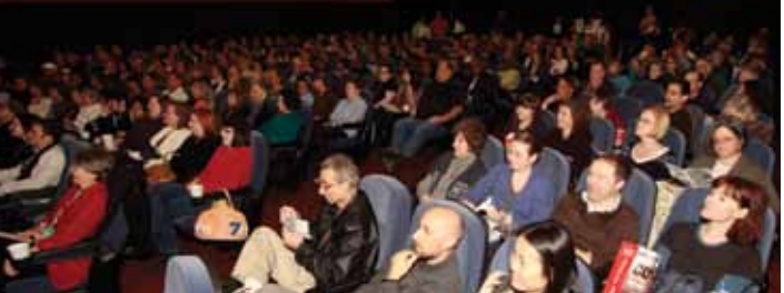
The Wild & Scenic Film Festival entertained hundreds of environmentally conscious movie-goers.

The program concluded with a special local feature Chattahoochee: From Water War to