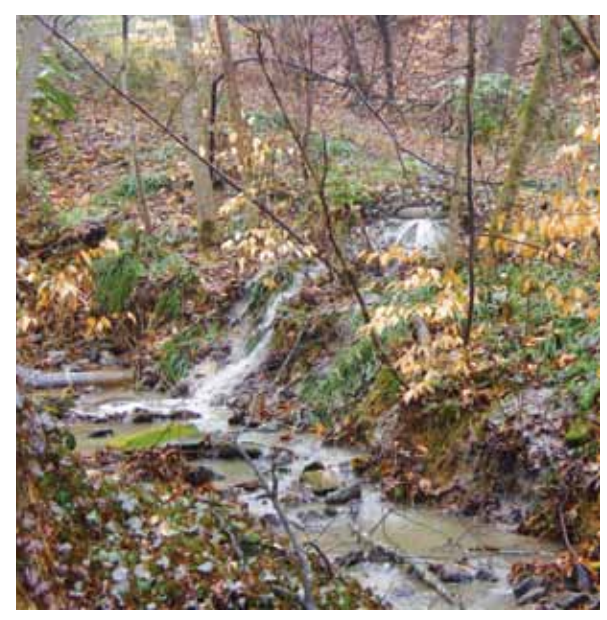
Water samples from an overflowing manhole in Cobb County confirmed the presence of raw sewage.

If you notice anything that appears to be wrong with a stream in your neighborhood, contact Jason Ulseth immediately at 404-352-9828, ext 16 or email him at julseth@ucriverkeeper.org.