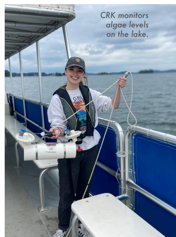
CRK monitors algae levels on the lake.

nutrient pollution, especially from leaking sewer lines and septic tanks, lawn fertilizers, and agricultural and urban runoff.